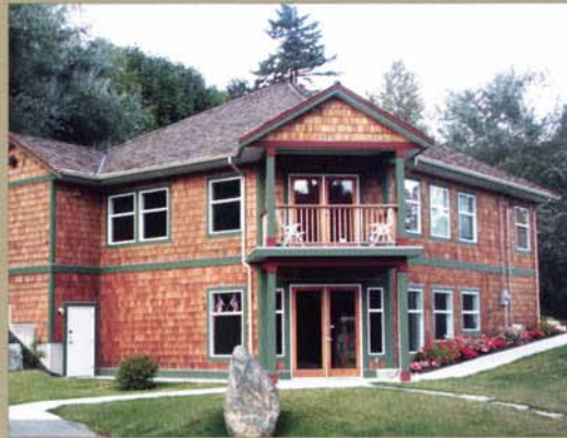
Mission Regional Chamber of Commerce Traditions West Designs Ltd.

Beautiful Durable Insulative Wind Resistant Withstands Thermal Shock Impact Resistant Light Weight